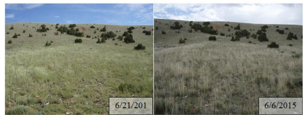
BICA_LTM_Veg080 photopoint number 2, south direction.