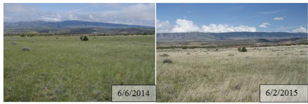
BICA_LTM_Veg070 photopoint number 1, east direction.

This difference in moisture can be seen in photographs taken in the park's vegetation plots (below). Vegetation in June of 2014 is much greener and more productive than in 2015.